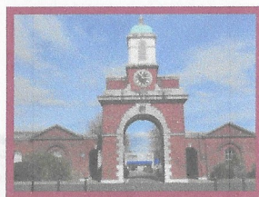
ST VINCENT Formerly Royal Marines Barracks